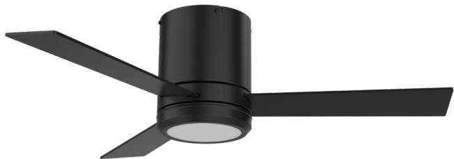
Black Finish with Light Kit