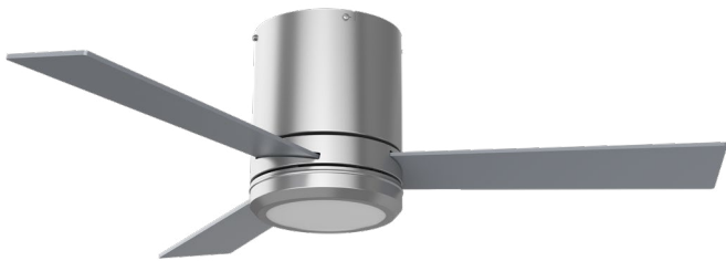
Satin Nickel Finish with Light Kit