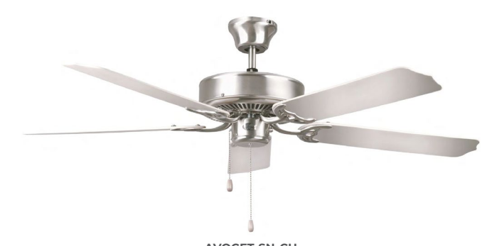
AVOCET-SN-CH Satin Nickel Housing Finish / Chrome Blade Finish