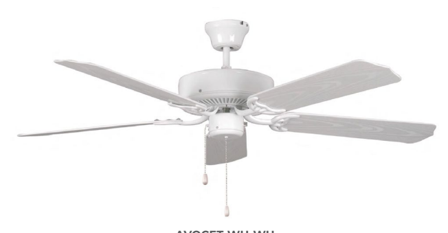
AVOCET-WH-WH White Housing Finish / White Blade Finish