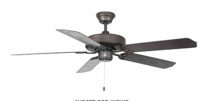
AVOCET-ORB-WGWB Oil Rubbed Bronze Housing Finish / Wood Grain Weathered Brown Blade Finish