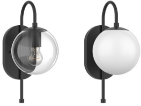
CLARK-WL EXTERIOR SCONCE E26