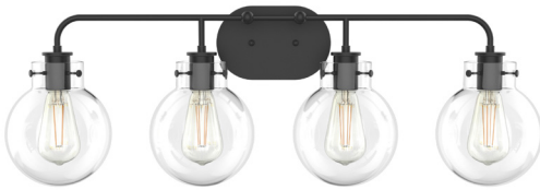
CLARK-4 VANITY E26