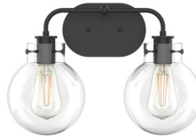
CLARK-2 VANITY E26