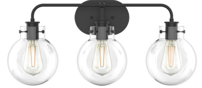
CLARK-3 VANITY E26