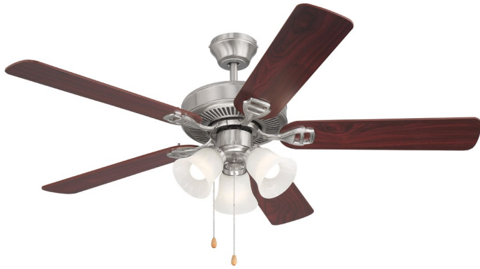
GULL-BN-RW Brushed Nickel Housing Finish / Rosewood Blade Finish