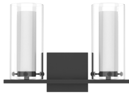
LEWIS-2 VANITY E12