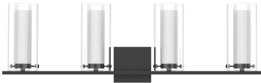
LEWIS-4 VANITY E12