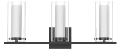
LEWIS-3 VANITY E12