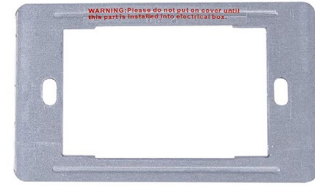
Mounting Bracket x1