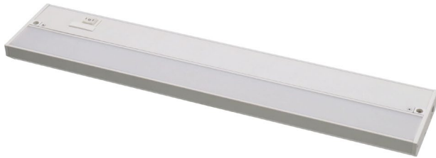
Field Selectable CCT